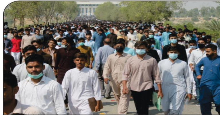
Candidates coming out from the Pre-Entry Test centres 2023