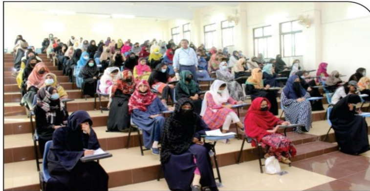
Female candidates appearing in Pre-Entry Test 2023