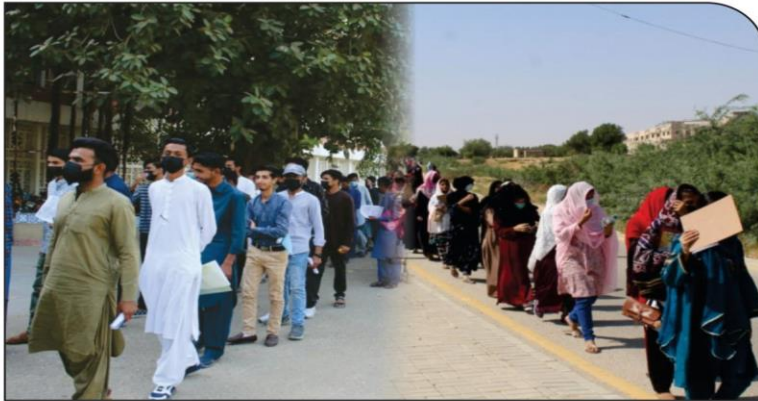
Male & Female candidates Moving towards Pre-Entry Test Centres 2023